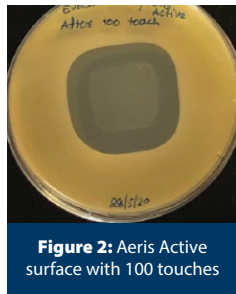
Figure 2: Aeris Active surface with 100 touches