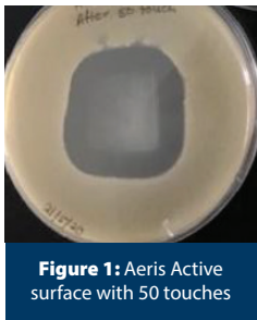
Figure 1: Aeris Active surface with 50 touches

Results demonstrating Aeris Active bactericidal effectiveness against S. aureus for 50, 100 and 200 touches.