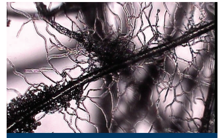
Untreated (Filter Fibres)