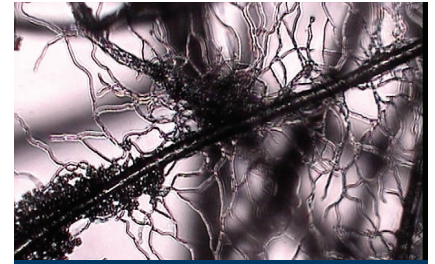
Untreated (Filter Fibres)