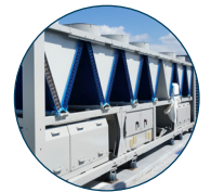
Evaporator Coils Condenser Coils Surfaces

LEADING COATINGS COMBINED WITH THE LEADING APPLICATOR TO PROVIDE YOU WITH THE BEST SOLUTION AVAILABLE